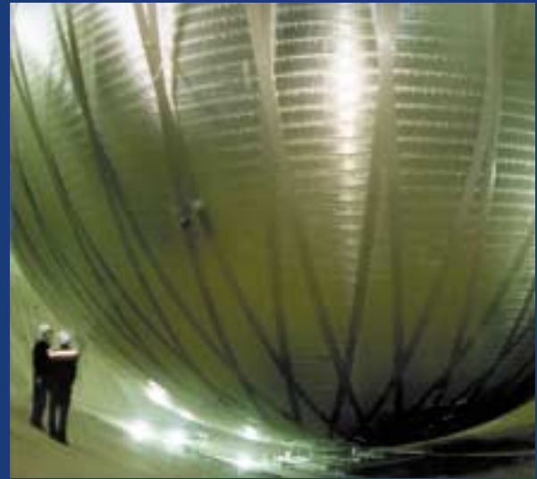
(LEFT): SEMI AUTOMATED INSULATION PROCESS