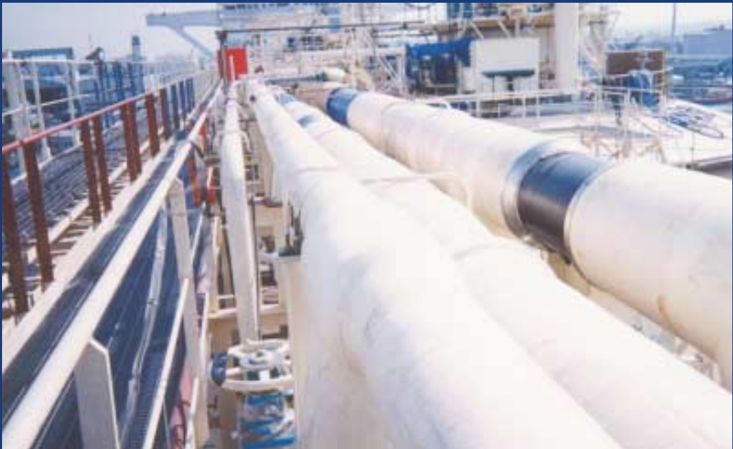
LOW TEMPERATURE PIPE INSULATION SYSTEM

Alternative services such as supervision and project administration can be delivered independent from materials and prefabricated products.