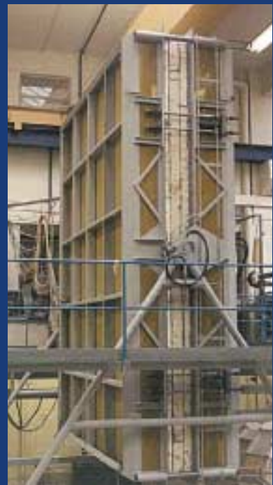
LOW TEMPERATURE INSULATION SYSTEM TESTING