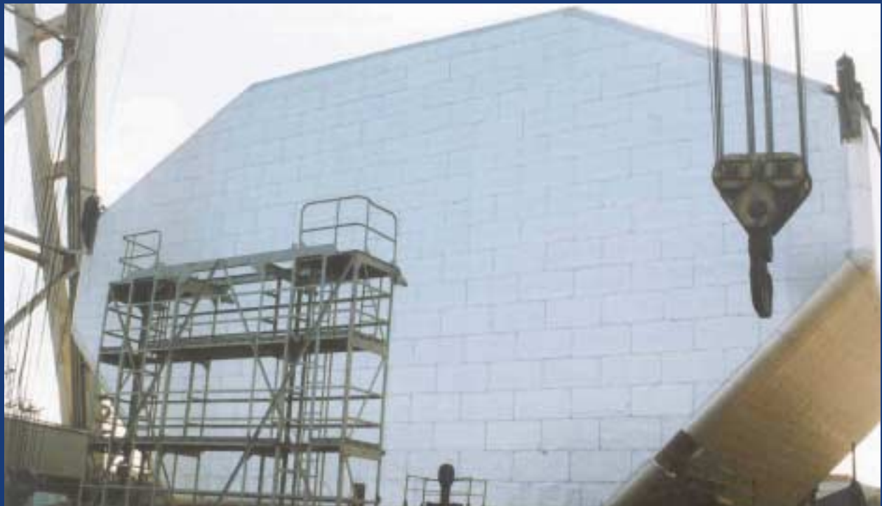
FINISHED LPG CARGO TANK INSULATION SYSTEM

The insulation systems are designed for flexible application, on land and on board.